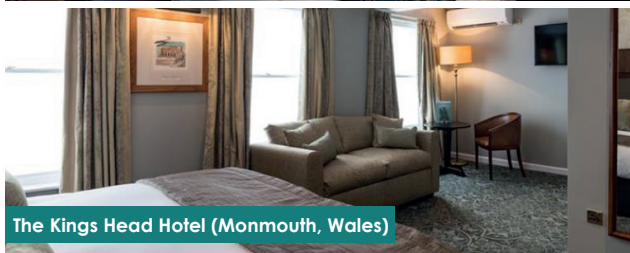
The Kings Head Hotel (Monmouth, Wales)