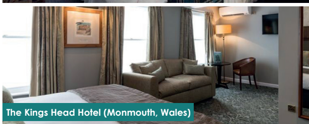
The Kings Head Hotel (Monmouth, Wales)