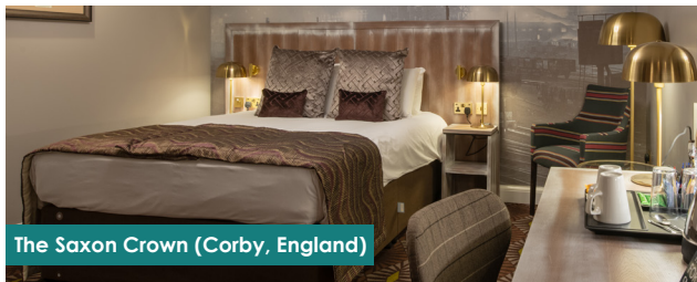
The Saxon Crown (Corby, England)