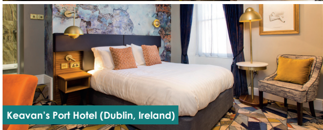
Keavan's Port Hotel (Dublin, Ireland)