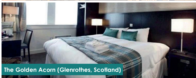
The Golden Acorn (Glenrothes, Scotland)