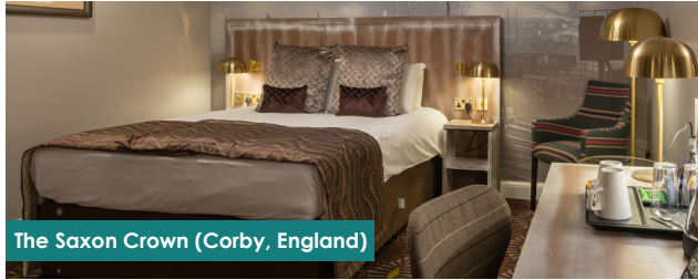
The Saxon Crown (Corby, England)

jdwetherspoon.com or the Wetherspoon app